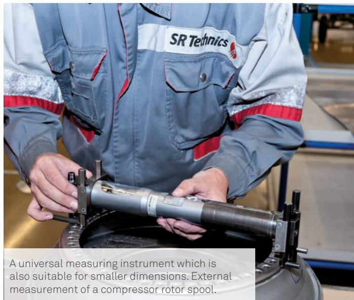
A universal measuring instrument which is also suitable for smaller dimensions. External measurement of a compressor rotor spool.

The TESA UNIMASTER is designed on the principle of an internal micrometer with two-point contact. The display setting of the instrument can be made via the setting gauge that is part of the delivery content. The tool is ideal for a wide variety of measurements, including diameters, bore sizes etc. The instrument can be converted from internal to external measurements using the adjuster screw on the mobile anvil. The reversal point is displayed on the integral shockproof lever-type indicator. The user-friendly device meets the high standards of SR Technics as a result of its consistent measurements, stiffness, heat-resistance and reliable display