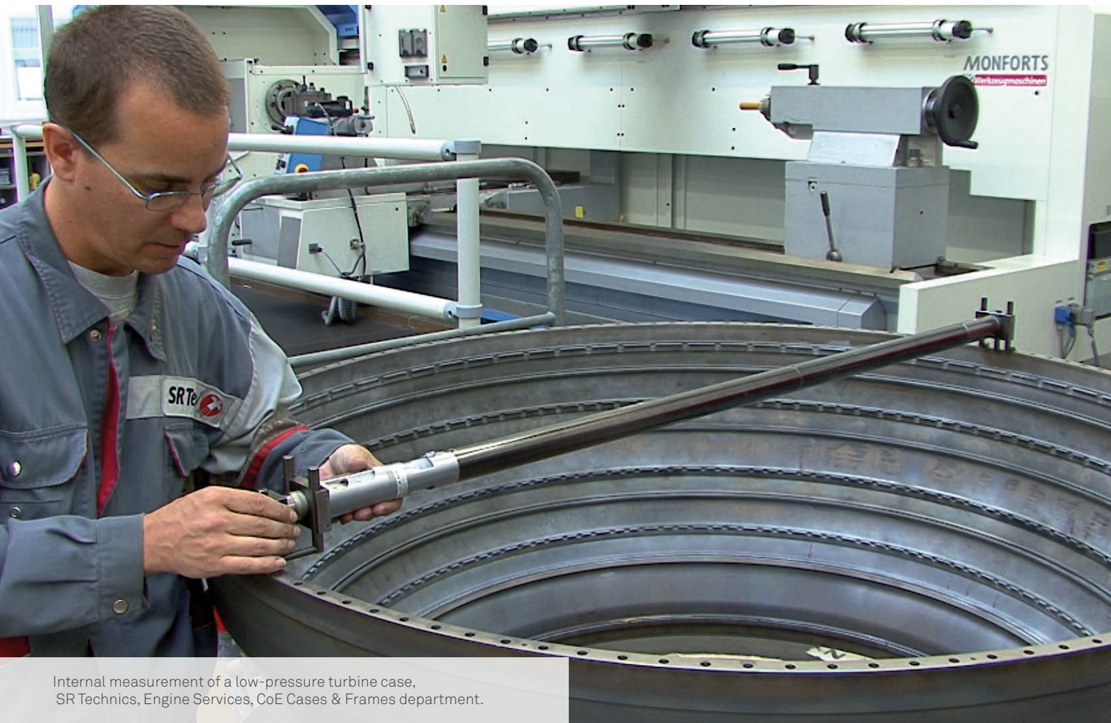
Internal measurement of a low-pressure turbine case, SR Technics, Engine Services, CoE Cases & Frames department.

This combination is hugely valuable when it comes to measuring heavy engine components, such as combustion chambers, diffuser cases or low-pressure turbine cases. The TESA UNIMASTER comes into its own when calipers are not sufficiently accurate and the transport of the work piece towards a 3D-coordinate measuring machine is too complex for logistical reasons.