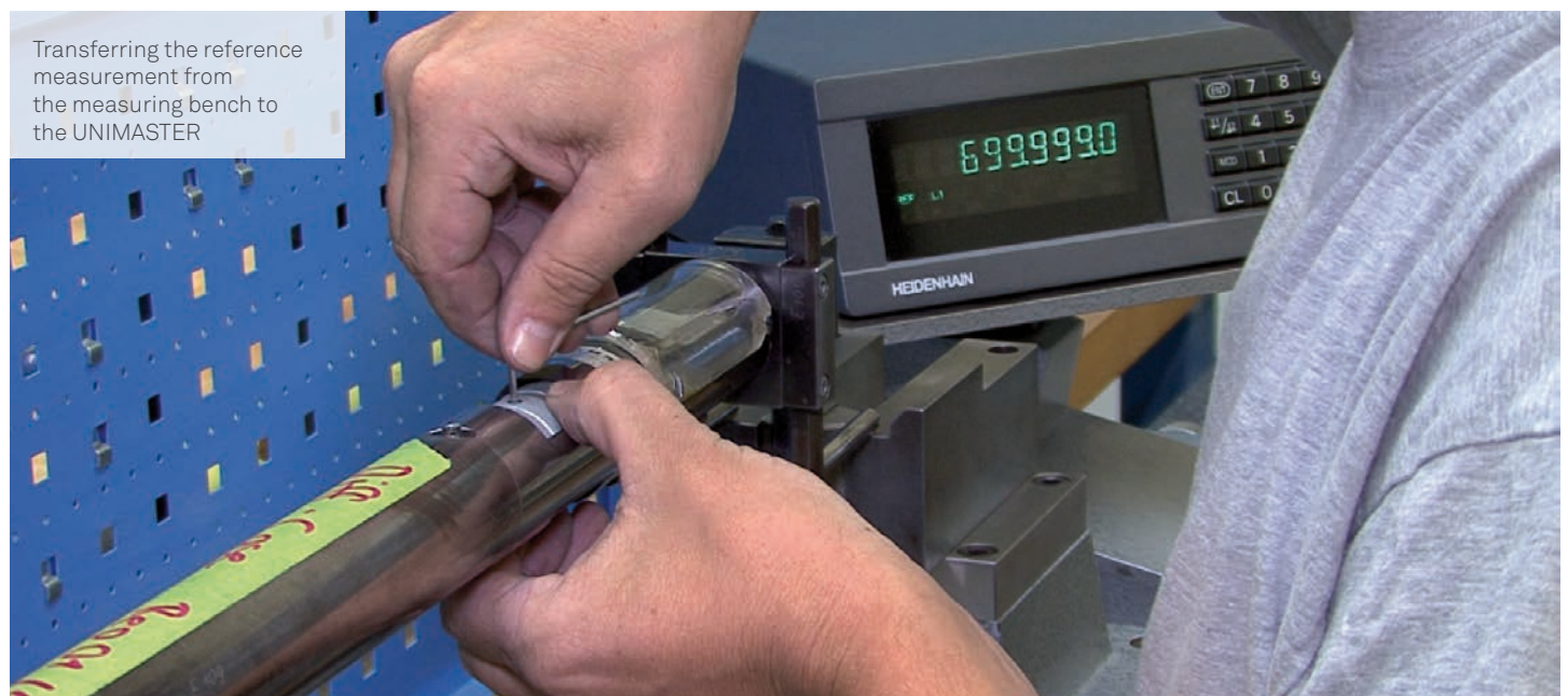
Transferring the reference measurement from the measuring bench to the UNIMASTER

After this the employee can take the calibrated measuring instrument directly to the component and make absolute measurements or faster comparative measurements in the chuck of the mill or lathe. As part of the maintenance process at SR Technics, the engine components are chrome- or nickel-plated or plasma-coated to repair any damage. In order to ensure that the diameter after the maintenance work remains the same as the original measurement, the component is inspected by means of the TESA UNIMASTER. Using the two-point measurement method, measurement errors can be effectively kept to a minimum.